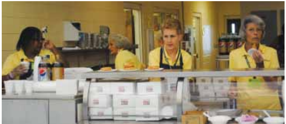
The Volunteers prepare to greet members at the 2010 Annual Meeting.