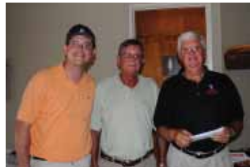
RBC/A&B Milling Co. are 2010 4-H golf tournament winners.

Golfers enjoyed biscuits provided by Hardee's of Scotland Neck before heading out on the course. Texas Steakhouse & Saloon of Roanoke Rapids and Rocky Mount served a