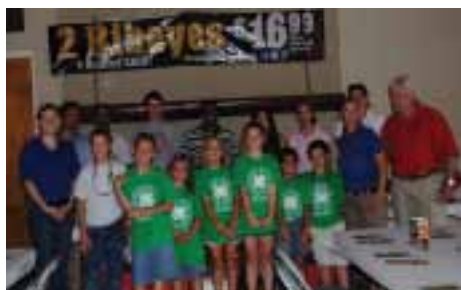
Texas Steakhouse staff with local 4-Hers.

Team AFLAC placed third while Lee Electric Construction Company