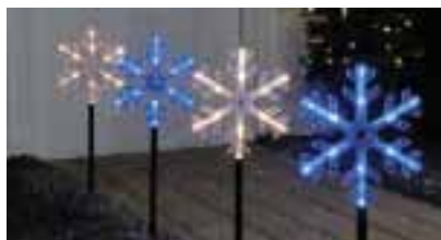
Holiday LEDs boast numerous benefits, including a variety of vibrant colors and big electric bill savings over traditional incandescent bulbs.