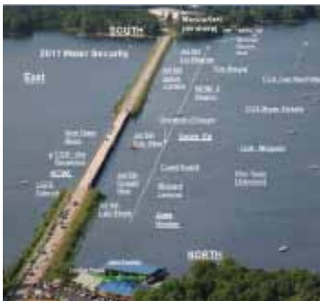
Eaton's Ferry bridge during "The Crossing." Boats are strategically placed in the water to protect the swimmers participating in the event.

We truly enjoy our responsibilities of safeguarding Lake Gaston boaters but additional members would allow us to do an even better job. There