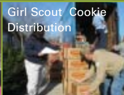
Girl Scout Cookie Distribution