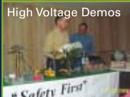
High Voltage Demos