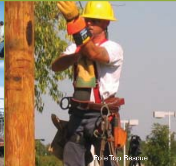
Pole Top Rescue