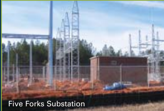
Five Forks Substation